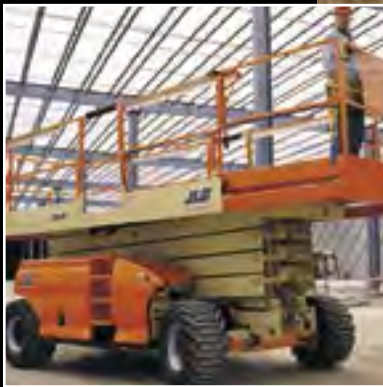
Wide Platforms Get You Closer to Your Work Area