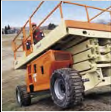
Twin Pump Power Delivers Unmatched Terrainability