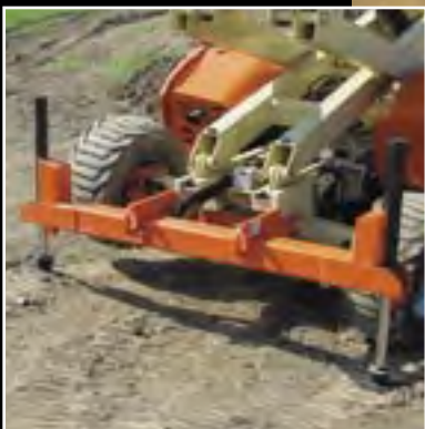
Optional One-Touch Leveling Jacks for Faster Set Up